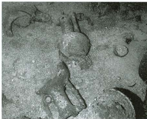
Fig. 13. Broken Rhodian amphoras atop and partially buried in the mound, near the Bozburun peninsula, Turkey.

Two survey areas were completed during the field season with the Maltese Ministry of Culture: one just south of Valetta harbor, the other within a small bay on the northern island of Gozo. The former was part of a cultural resources impact assessment for the Maltese government that resulted in the survey of 33 km 2 outside Marsascalea Bay, on the southeastern coast of