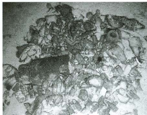
Fig. 15. The eastern concentration at the Levanzo wreck site, Sicily.

lic concrete. A Cordiam Model M60-0 hydraulically powered coring device (a new technology) took intact cores (diam. 0.09 m x max. lgth. 6.0 m) from Roman maritime structures above and below sea level (fig. 16).